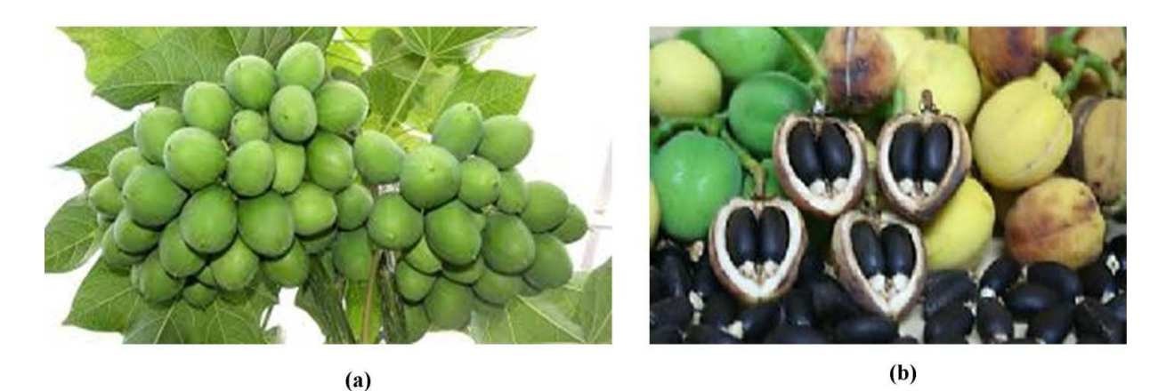
Figure 3. Fruits (a) and seeds (b) of Jatropha curcas Linn. Each inflorescence yields a bunch of approximately 10 or more ovoid fruits. A three, bi-valved cocci is formed after the seeds mature and the fleshy exocarp dries. The seeds become mature when the capsule changes from green to after months retrieved yellow, 2 to 4 (b).

The eminence and value of J. curcas Linn. was strongly highlighted in 2004/2005, when the plant began to be viewed globally as a possible source of biofuel (Tomomatsu and Swallow 2007), (Fairless 2007), (Slingerland and Tjeuw 2014). The seeds contain 27-40% oil that can be processed to produce a high-quality biodiesel fuel, usable in a standard diesel engine.