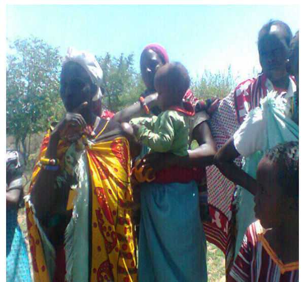
MUAC measurements (This done to determine the weight of children)