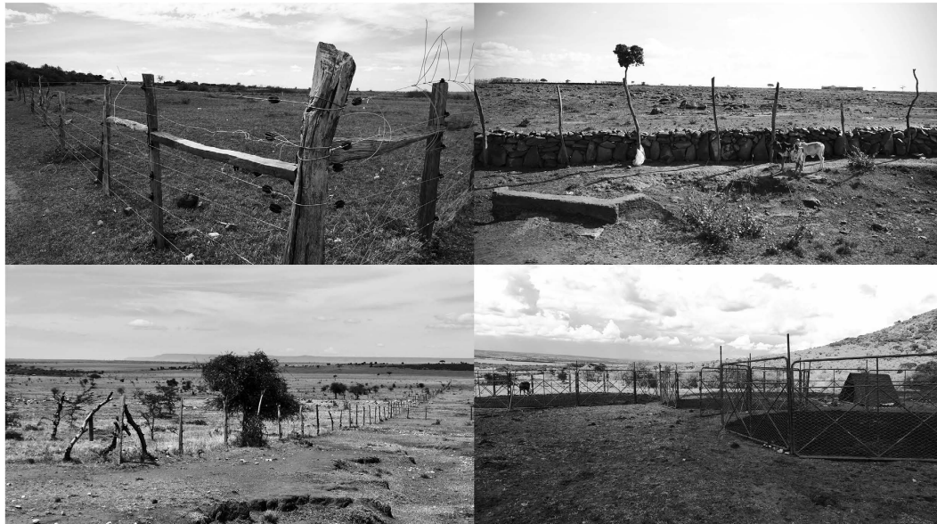
Figure 1. Examples of fences in the Greater Mara. By Mette Løvschal.

new game-proof fence to be built in 1966 that cut off and redirected a wildebeest migration with directly observable negative consequences on population size 11 .