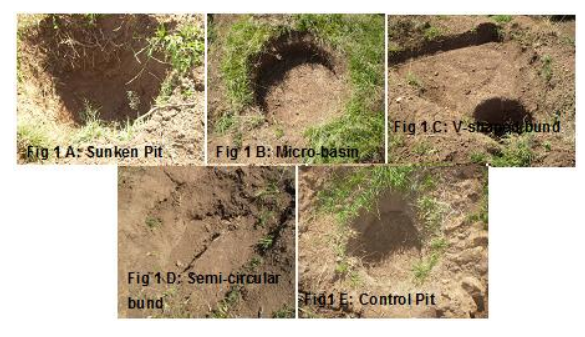
Fig. 1. Different Micro-catchments designs used in Nyando District.

The experiment was set up in March 2007. Sesbania sesban, Grevillia robusta, Eucalyptus grandis, Gliricidia sepun and Casuaria equisitifolia were planted in different micro-catchments viz: sunken pits, micro-basins, v-shaped bunds, semi-circular bunds and a control (where conventional planting hole was used) were laid down and replicated three times in a split plot design. For each treatment, 8 seedlings of for each species were planted. Therefore, a total of 120 seedlings for each species were planted in each treatment. One shovel full of manure was added and mixed with the soil before filling back the holes. The plots were fenced off to avoid browsing by animals, spot weeding and micro-catchment maintenance was done after every 2 months during data collection.