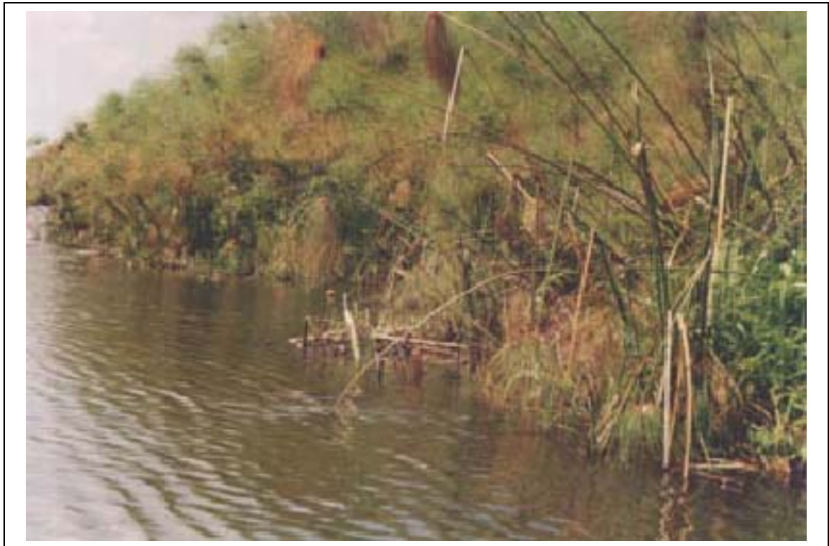
Figure 2: Part of the shore of Lake Kanyaboli. Note the dense papyrus fringed littoral zone. The lake is completely surrounded by such dense papyrus vegetation.

Lake Kanyaboli is of great conservational interest. The lake contains relic populations of cichlids that have been severely reduced and are almost extinct in Lake Victoria. Viable populations of the native Lake Victoria tilapias Oreochromis esculentus and Oreochromis variabilis that have virtually been eliminated from Lake Victoria due to Nile perch predation occur in Lake Kanyaboli. Secondly, Lake Kanyaboli acts as refuge for the following haplochromine species: Lipochromis maxilaris , Astatotilapia nubila , Astatotilapia bigeye (Kaufman), Pseudocranilabrus multicolor victoriae , Xystichromis phytophagus and Astatoreochromis alluaiudi . L. maxilaris and X. phytophagus are critically endangered haplochromines (IUCN, 2002). A recent molecular phylogenetic study uncovered a very high genetic variation in the Lake Kanyaboli haplochromines (Abila, 2004). This illustrates that Lake Kanyaboli can act as a ‘genetic reservoir’ for Lake Victoria’s species flock. The fish fauna found in Lake Kanyaboli furthermore includes O. niloticus , O. leucostictus , T. zilli , Clarias mossambicus , Protopterus aethiopicus and Xenoclarias sp. (Aloo,