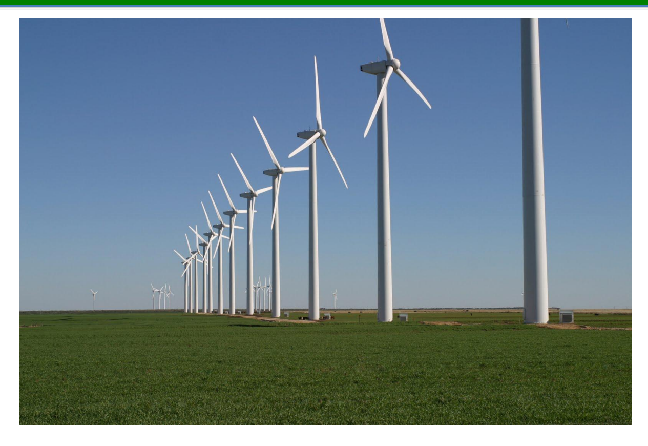
Green technologies for renewable energy generation from geothermal, solar and wind sources.

Although the country has largely relied on hydro-electric power generation for many decades, water levels in dams due to prolonged droughts as a result of climate change has adversely affected power generation leading rationing and power outages. The adoption of green initiatives in the energy sector is an important intervention as the country strives to become an emerging economy by 2030.