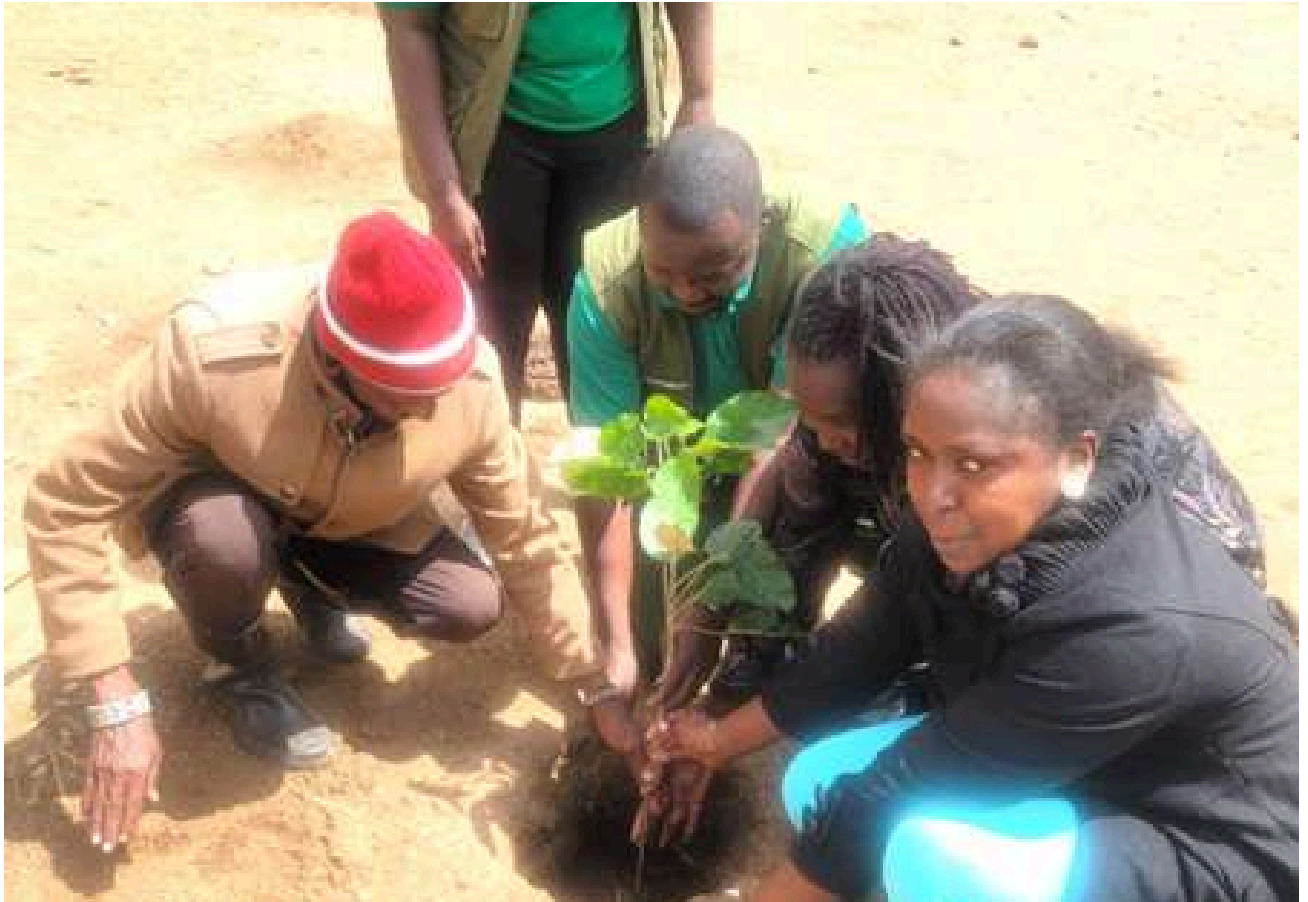
University staff planting seedlings at Osegel Comprehensive School, Narok North