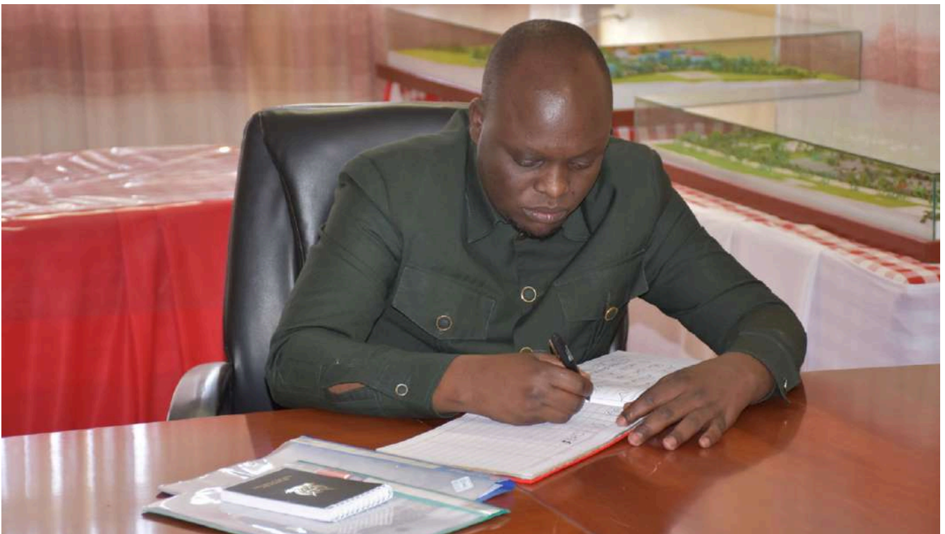
The Deputy Governor of Narok County, Hon. Tamalinye Koech, signing the visitors book.