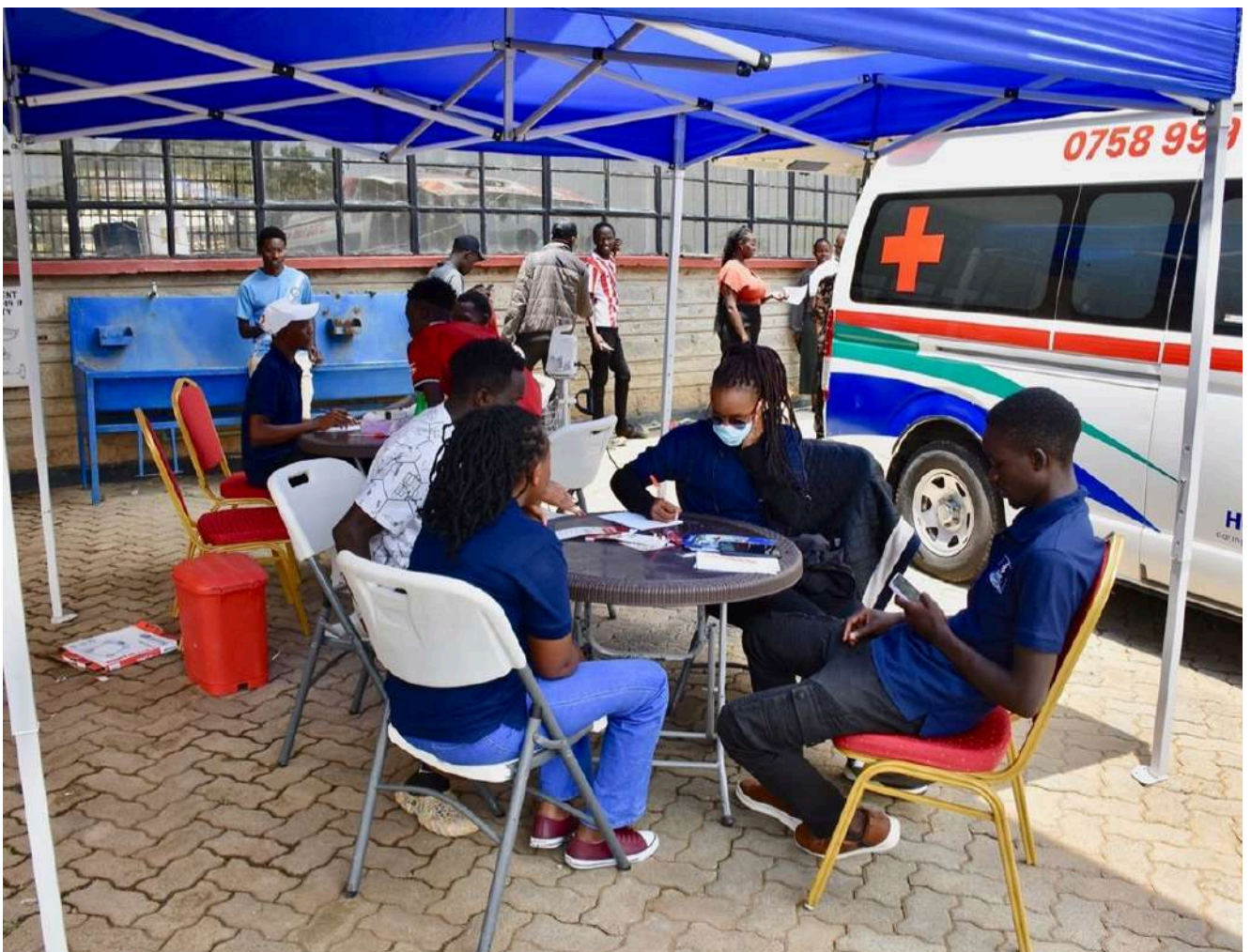
Light Shepherd Hospital offered various health services to students at the University during the outreach services.