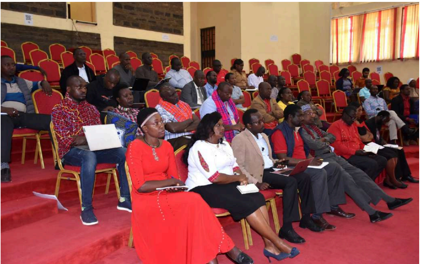
A cross-section of members of the University staff keenly following the proceedings of the meeting.