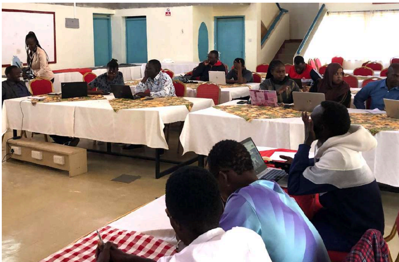
Practical sessions: accelerating digital transformation with the official rollout of Microsoft Office 365 E3 and E5 licenses.