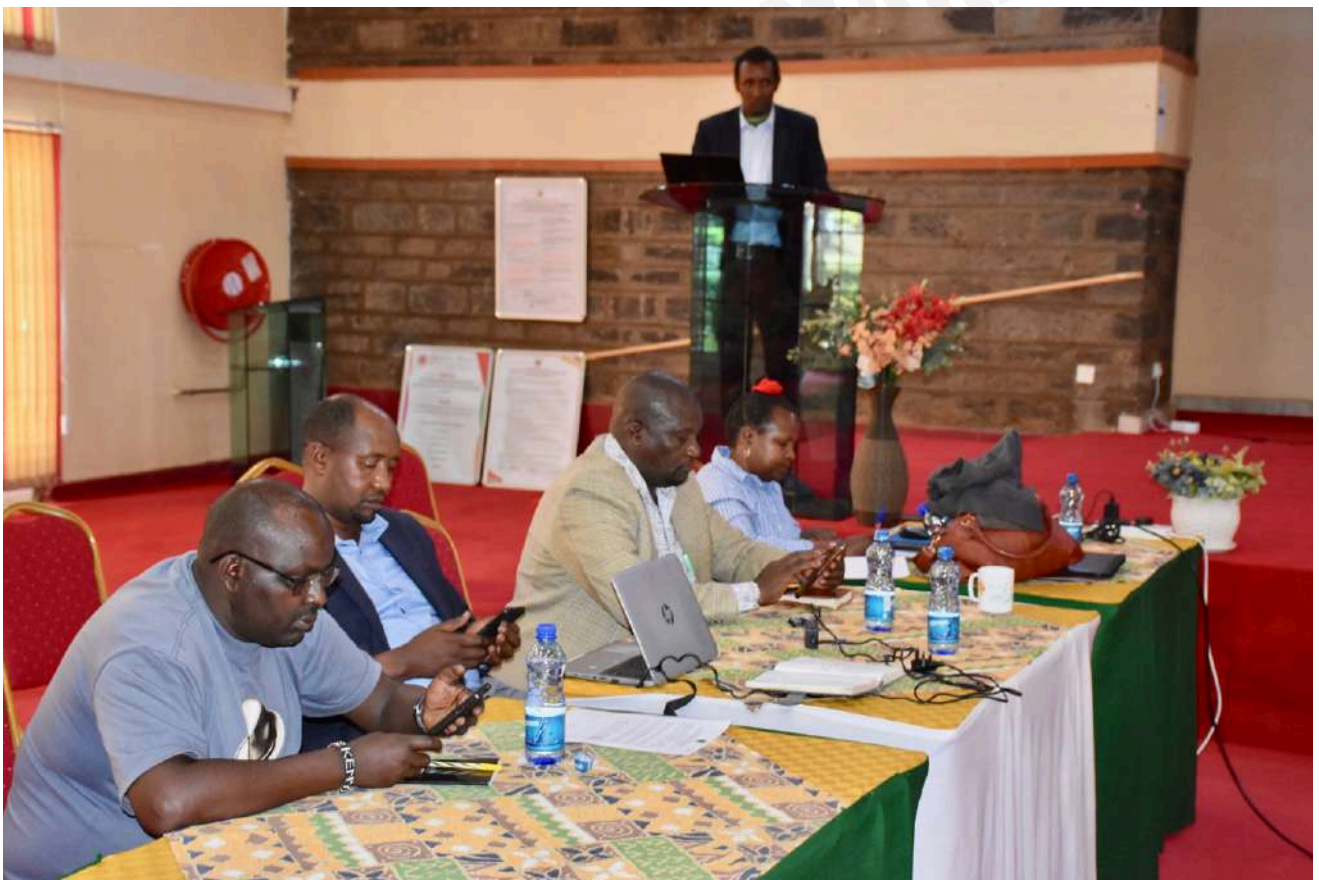
A cross-section of the participants in attendance