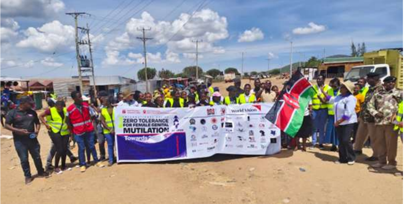
Opening procession for the International Day of Zero Tolerance to Female Genital Mutilation (FGM) held at Naikarra Comprehensive Boarding School, Naikarra Ward, Narok West Sub-County

Maasai Mara University participated in the commemoration of the International Day of Zero Tolerance to Female Genital Mutilation (FGM) held at Naikarra Comprehensive Boarding School, Naikarra Ward, Narok West Sub-County on 5th February 2026. World Vision organised the event in collaboration with other Civil Society Organizations and development partners under the umbrella of the Narok County Gender Technical Working Group.