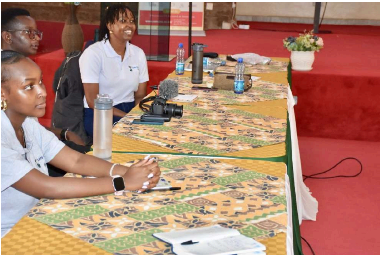
Some of the facilitators from Let's Go Travel Uniglobe: MAARIFA Programme