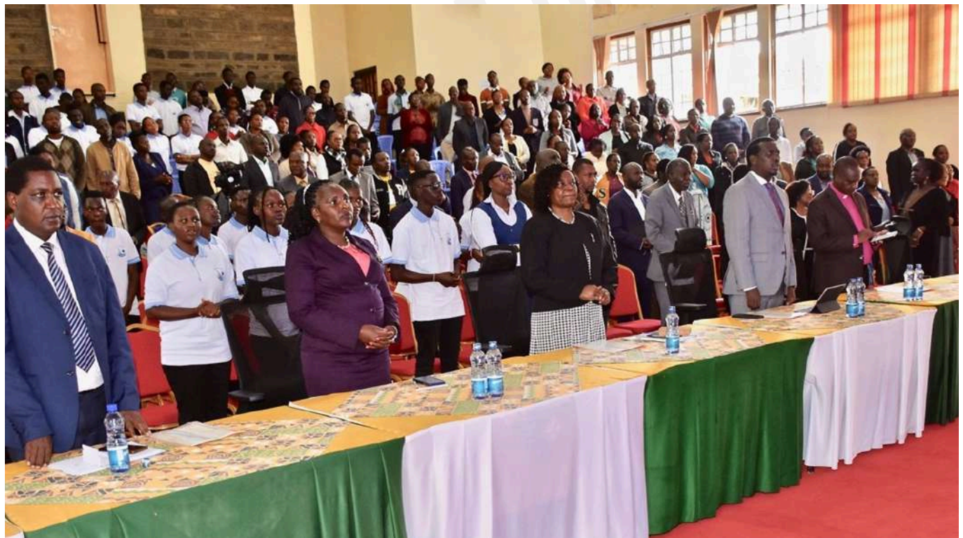
University management present, visitors, staff and students in a prayer moment.