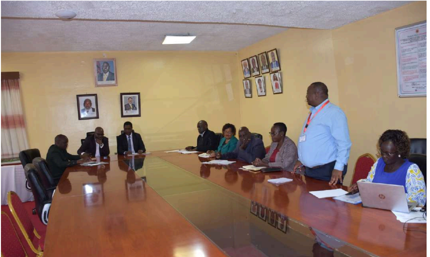
Ongoing session charting a way forward for the establishment of Maasai Mara University college in Emurua Dikirr Constituency.