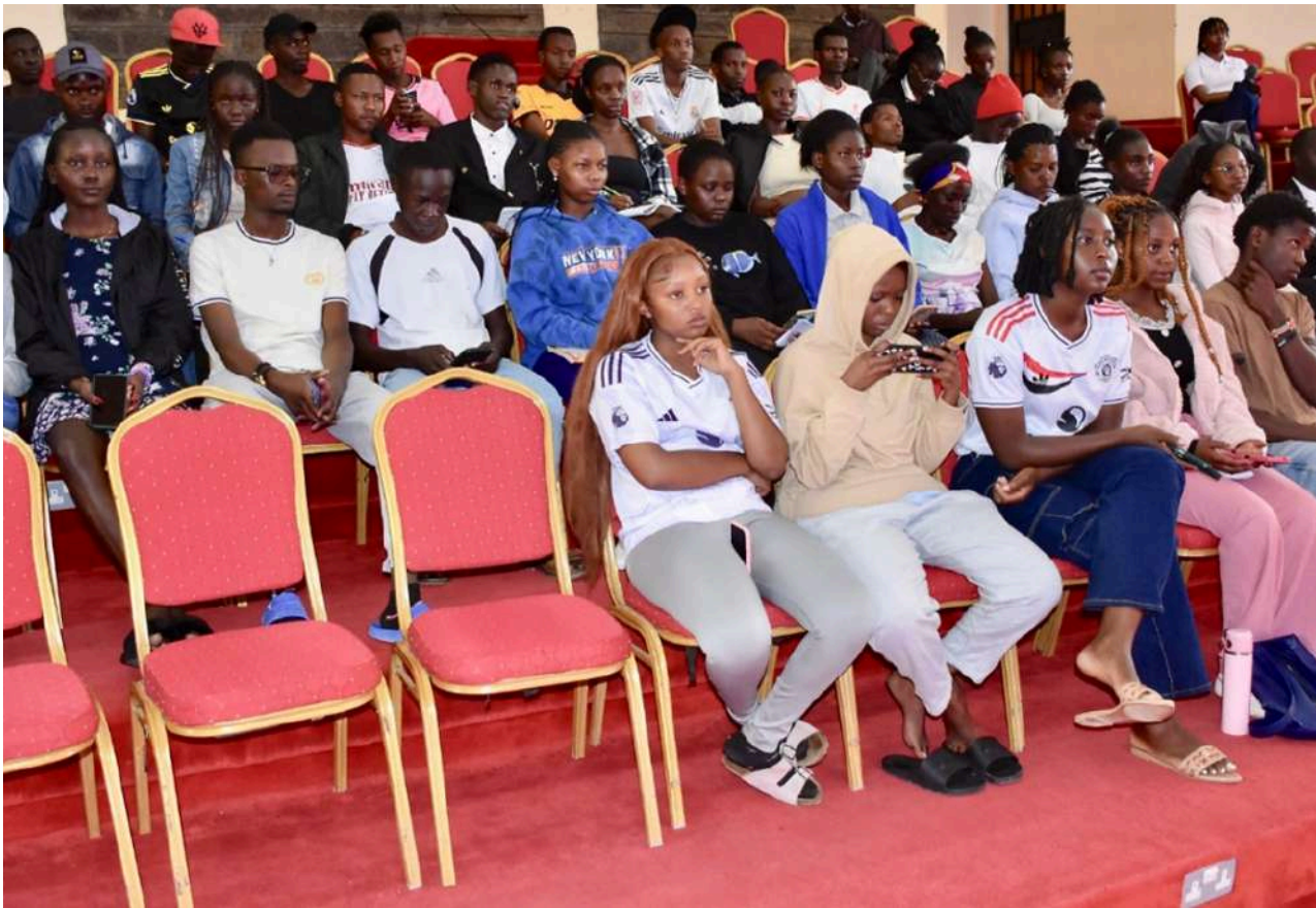
Some of the Mmara-U students attentively following the Sustainability Talk proceedings at the Main Hall.