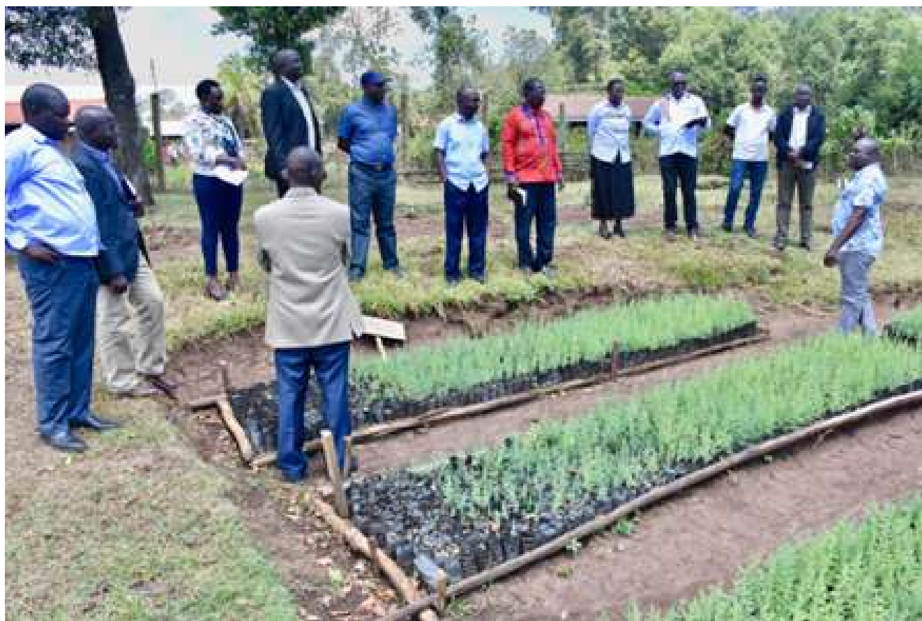
Forestry officer (right) taking the team through modern tree nursery management at the KFS tree nursery and practical learning field.