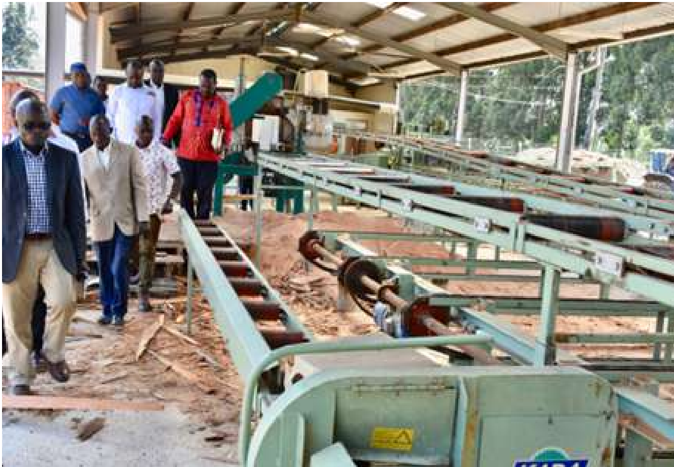
The team touring the KFC value addition centre which is well equipped and placed in wood production technology, processing and preservation. Graduates under-go a holistic training in forestry from tree nursery to final products value addition.