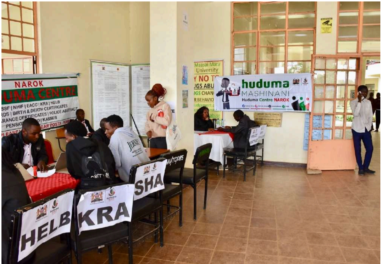
Integrated Government services at the doorstep. Students and staff benefited from a range of government services