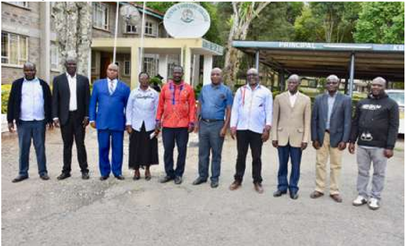
Representatives from Maasai Mara University and Kenya Forestry College in a group photo outside KFC administration block.

The visit marked an important step in implementing the Mmara-U and Kenya Forest Service MOU, strengthening partnerships, fostering knowledge exchange, and enhancing academic excellence in forestry and environmental studies.