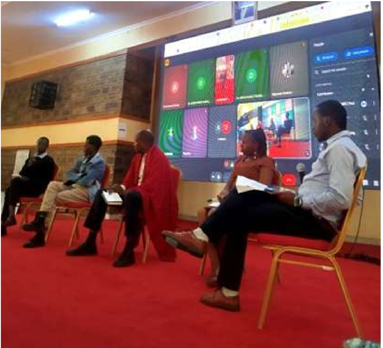
The panellists at the celebration of the International International Mother Tongue Language Day held in the Main Hall