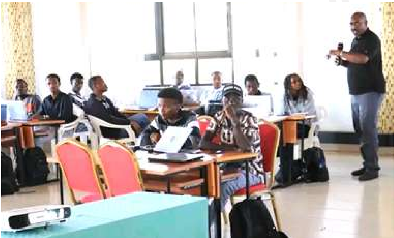
Mmara-U was well represented during the National Earth Observation and Innovation Lab Project Competition held at Dedan Kimathi University of Technology (DeKUT).

The event was jointly organized by DeKUT, the Kenya Space Agency (KSA), and Expertise France (EF), and hosted by the Center for Spatial Information Science and Systems (CSISS) under the Institute of Geomatics, GIS and Remote Sensing (IGGRoS).