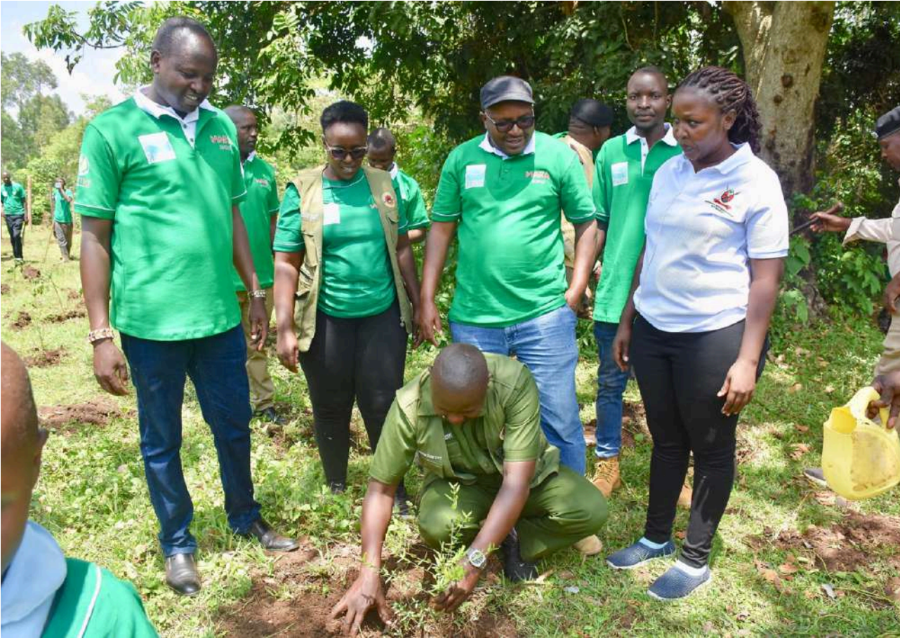
University staff planting seedlings during the event