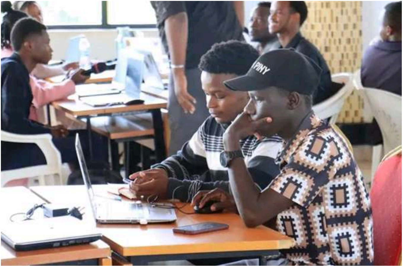
Mmara-U representatives at the competition.