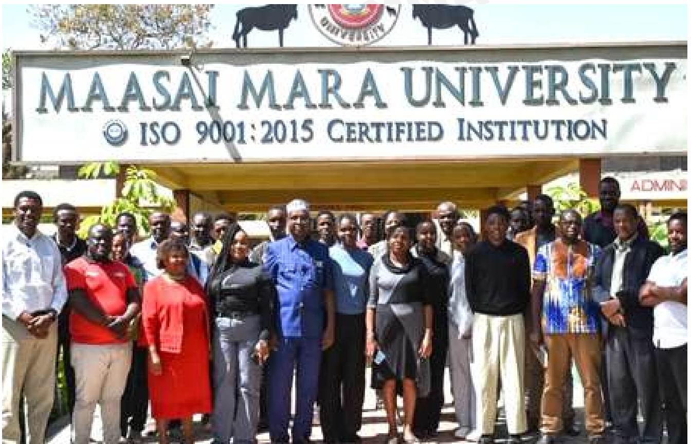
Participants of the Rollout of Microsoft Office 365 E3 and E5 licenses in a group photo.

Beyond providing staff with access to powerful productivity tools such as Word, Excel, PowerPoint, OneDrive, and SharePoint, the deployment signals a broader transformation. It reflects Kenya's commitment to strengthening ICT infrastructure in public institutions, ensuring that education and governance are powered by secure, modern, and collaborative technologies.