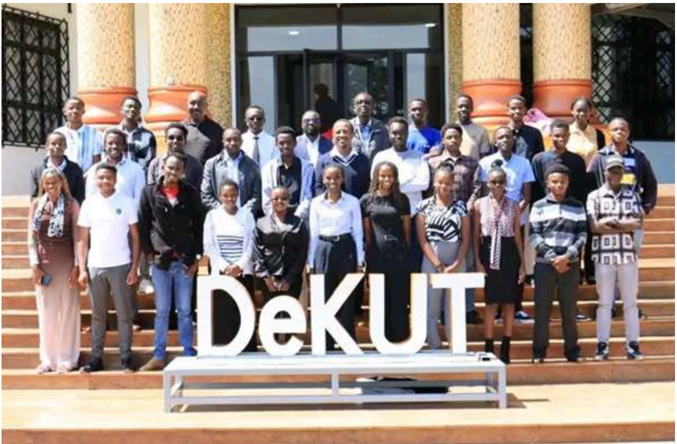
A group photo of the participants at the National Earth Observation and Innovation Lab Project Competition held at Dedan Kimathi University of Technology (DeKUT).