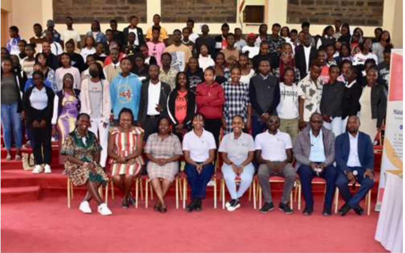
A group photo of the Sustainability Talk meeting participants

Let'sGo Travel Uniglobe, under the aegis of MAARIFA Programme, and in collaboration with the School of Tourism and Hospitality successfully hosted an engaging and insightful Sustainability Talk for 121 students passionate about shaping the future of travel and hospitality. This is in line with the niche of the university on Tourism, Environmental Management and Conservation