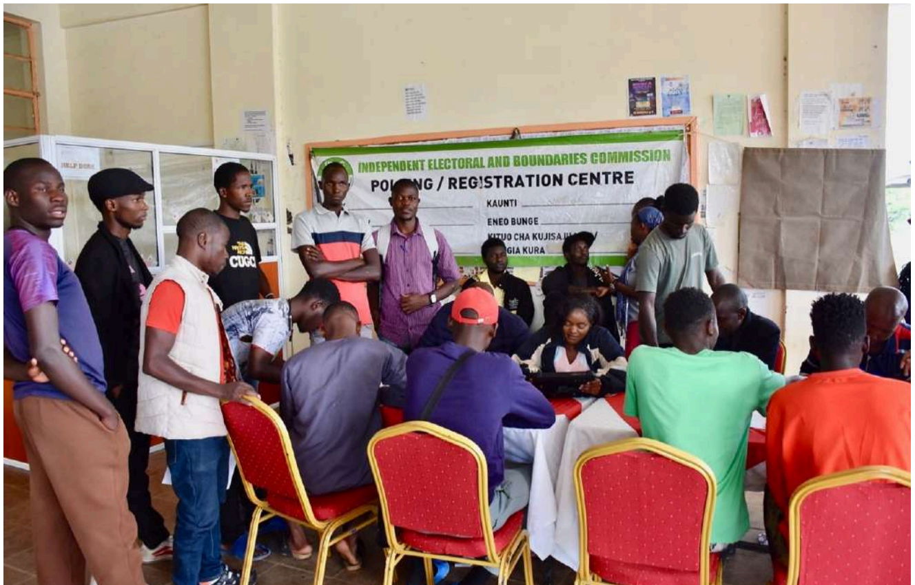
Voter registration exercises offered at the University premises.

Meanwhile, the IEBC conducted continuous voter registration in preparation for the 2027 General Elections, encouraging eligible students to register and participate in the democratic process. The initiative reflects the university's commitment to supporting student welfare, civic engagement, and institutional collaboration.