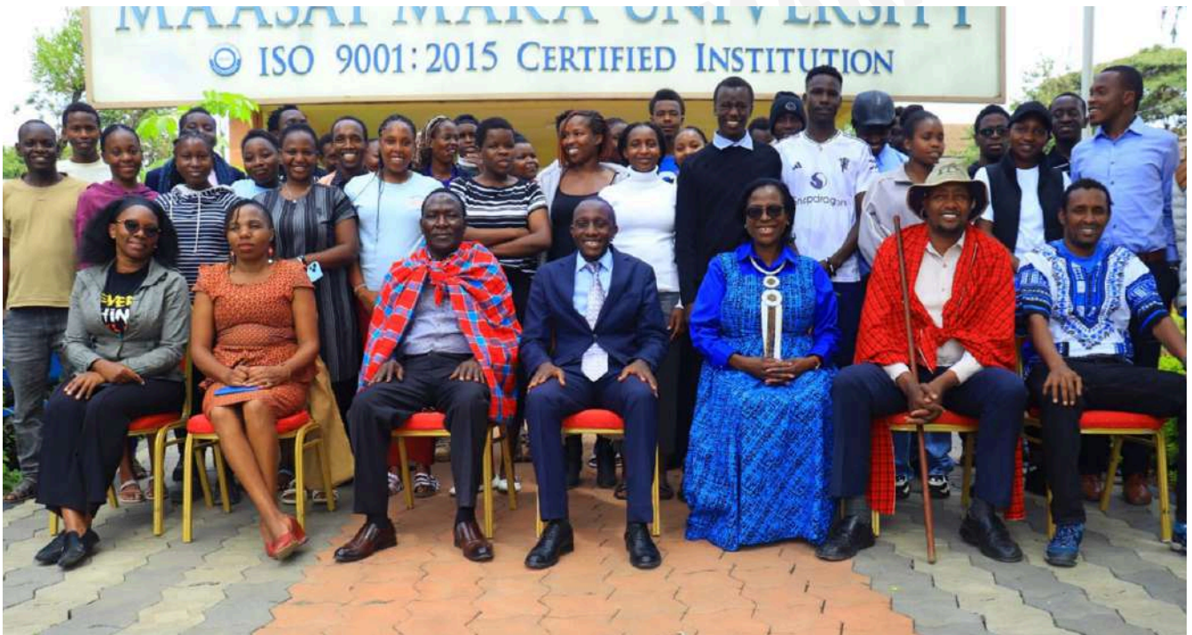
A group photo of the participants during the celebration of the International Mother Language Day

The celebration concluded with a strong call to embrace and promote mother languages as vital tools for cultural identity, heritage preservation, and sustainable development