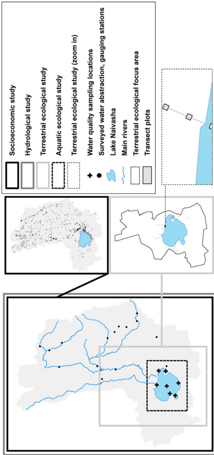
Figure 3. Fieldwork locations for the different focus disciplines of this study: for the hydrological system, discharge measurement stations; for the aquatic ecological system, water quality sampling sites; for the terrestrial ecological system, transects along the lakeshore; for the socio-economic system, water abstraction locations.