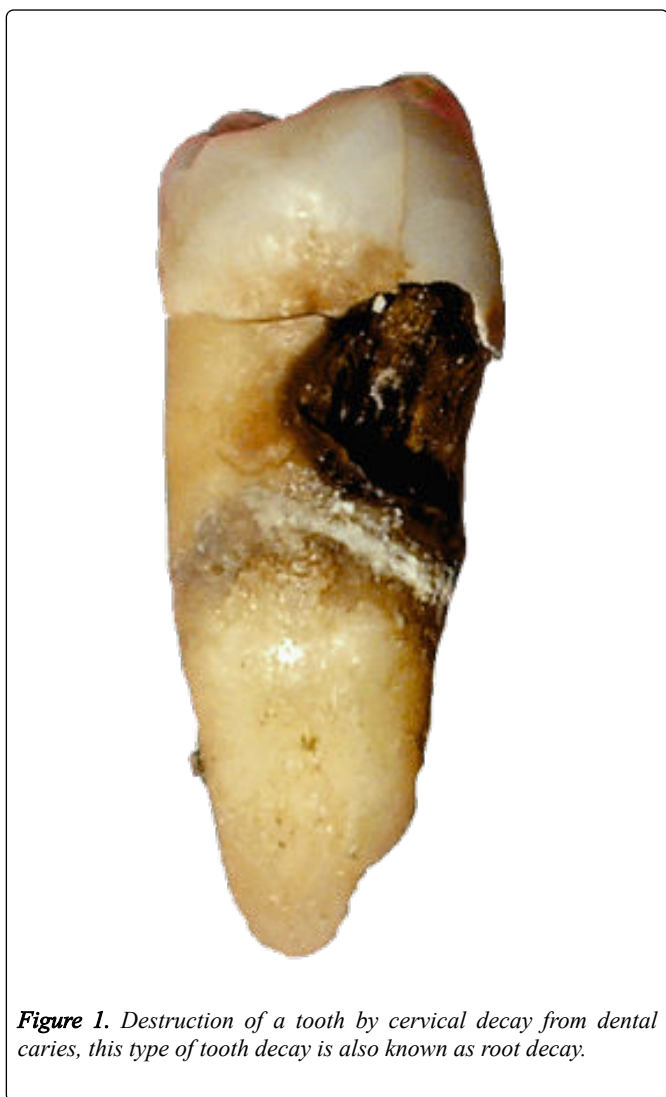
Figure 1. Destruction of a tooth by cervical decay from dental caries, this type of tooth decay is also known as root decay.

Depending on the extent of tooth destruction, various treatments can be used to restore teeth to proper form, function, and aesthetics, but there is no known method to restore large amounts of tooth structure ( Figure 1 ). Instead, dental health organizations advocate preventive and prophylactic measures, Such as regular oral hygiene and dietary modifications, to avoid dental caries (Oral Health Topics: Cleaning your teeth and gums, 2006).