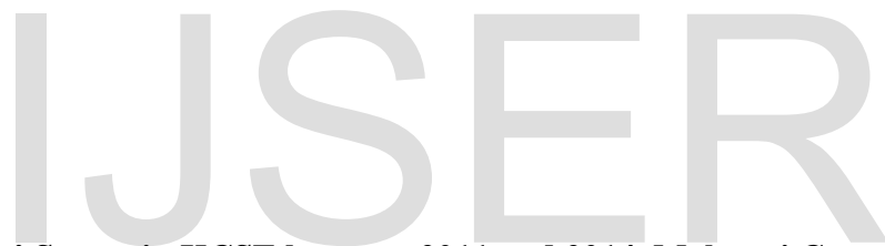
Table 1: Students' Scores in KCSE between 2011 and 2014, Makueni County

In Makueni County, Kenya, academic performance in the Sciences has been low over the past years as compared to the other subjects offered in the curriculum. Table 1 below shows students' average performance in the Sciences in the period of (2011-2014) in comparison to some of the other subjects in the curriculum. This performance is given in terms of the KCSE grading scale of 1-12(grade E to A), which gives the best performance as 12 corresponding to a grade A, while 1 is the poorest and corresponds to a grade E. Table 1 shows the details of this performance.