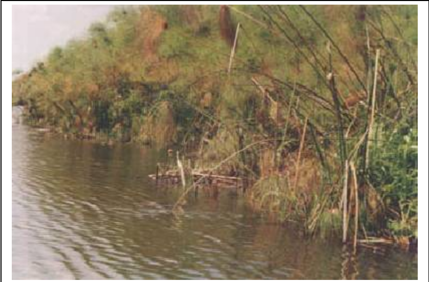
Figure 2: Part of the shore of Lake Kanyaboli. Note the dense papyrus fringed littoral zone. The lake is completely surrounded by such dense papyrus vegetation.

Lake Kanyaboli is of great conservational interest. The lake contains relic populations of cichlids that have been severely reduced and are almost extinct in Lake Victoria. Viable populations of the native Lake Victoria tilapias Oreochromis esculentus and Oreochromis variabilis that have virtually been eliminated from Lake Victoria due to Nile perch predation occur in Lake Kanyaboli. Secondly, Lake Kanyaboli acts as refuge for the following haplochromine species: Lipochromis maxilaris , Astatotilapia nubila , Astatotilapia bigeye (Kaufman), Pseudocranilabrus multicolor victoriae , Xystichromis phytophagus and Astatoreochromis alluaiudi . L. maxilaris and X. phytophagus are critically endangered haplochromines (IUCN, 2002). A recent molecular phylogenetic study uncovered a very high genetic variation in the Lake Kanyaboli haplochromines (Abila, 2004). This illustrates that Lake Kanyaboli can act as a ‘genetic reservoir’ for Lake Victoria’s species flock. The fish fauna found in Lake Kanyaboli furthermore includes O. niloticus , O. leucostictus , T. zilli , Clarias mossambicus , Protopterus aethiopicus and Xenoclaris sp. (Aloo, 2003). The adjoining Yala Swamp forms an important habitat to the